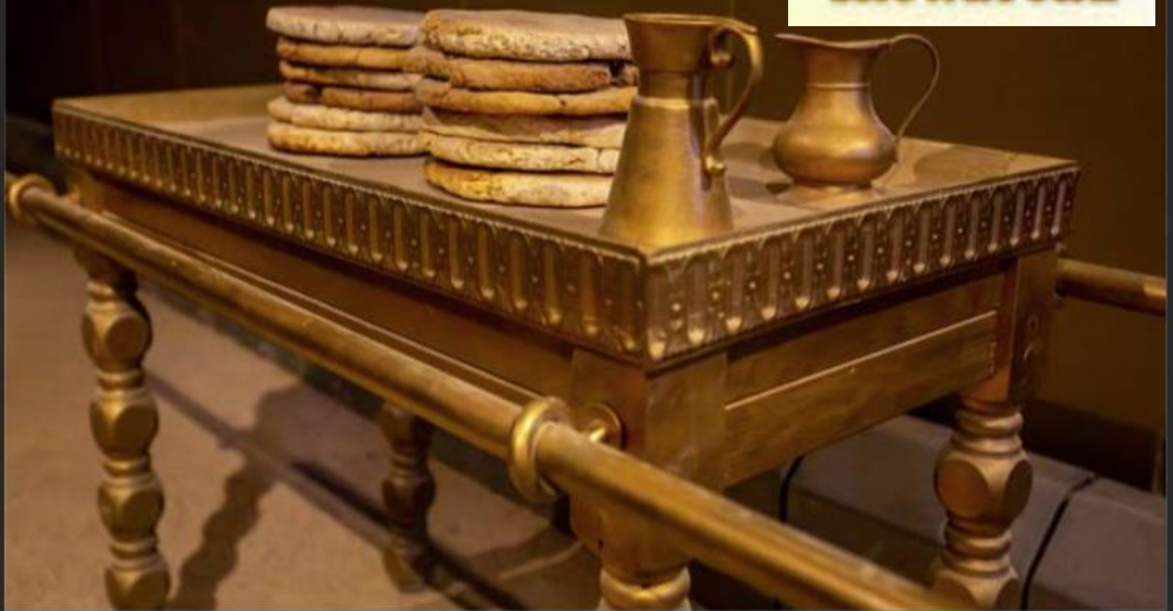
Table of Shewbread

Jesus Christ – Bread of life – Fellowship - with God and Man